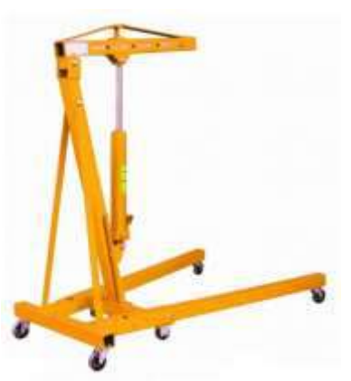
MANUAL FLOOR CRANE