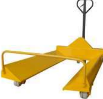
ROLL PALLET TRUCK