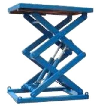
SCISSOR LIFT TABLE