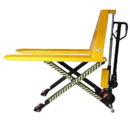
SCISSOR PALLET TRUCK