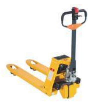
ELECTRIC PALLET TRUCK