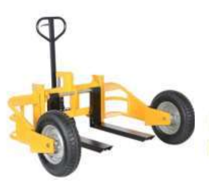
TERRAIN PALLET TRUCK